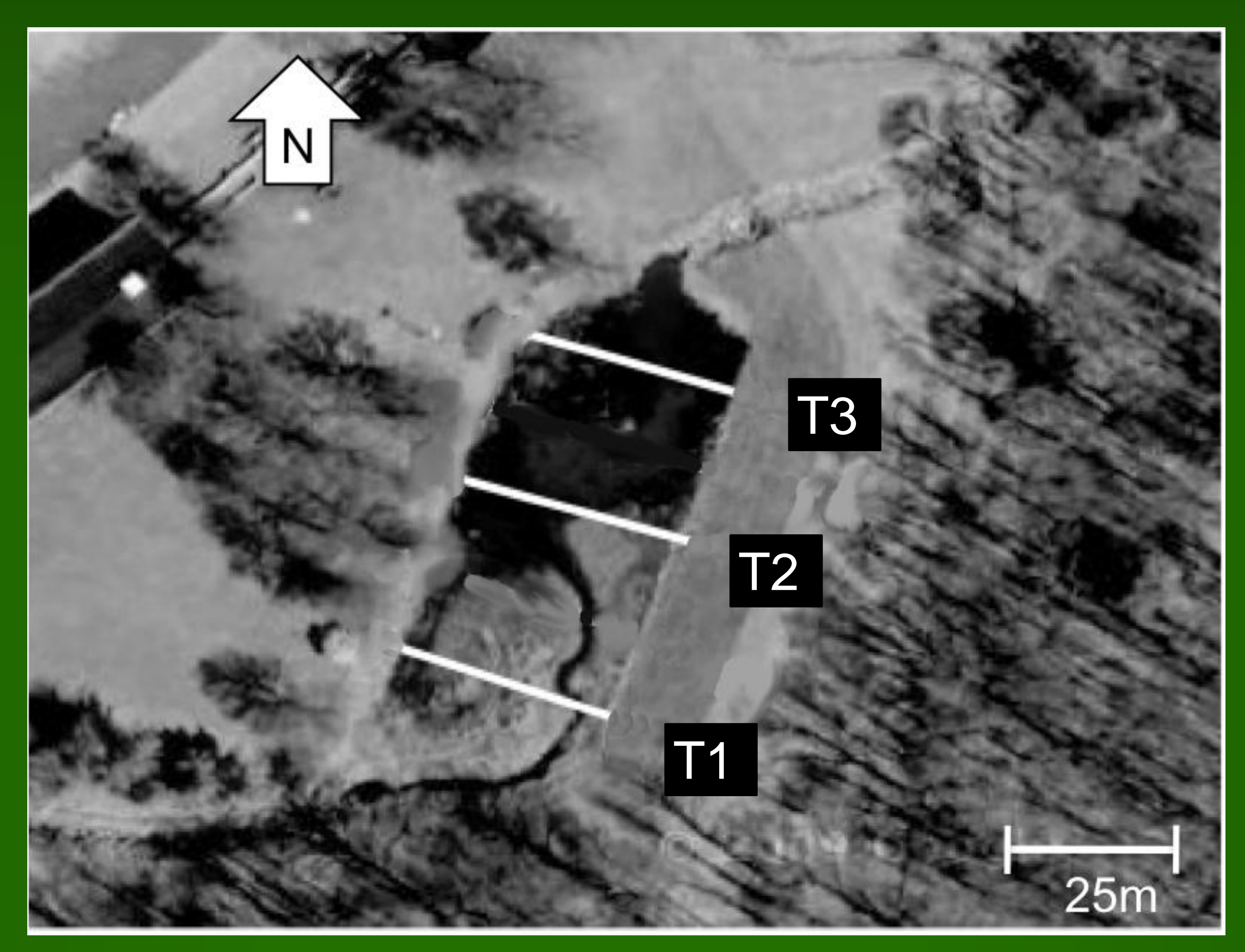
Figure 2: Map of Lake Lieberman wetland on Binghamton University campus (altered from Google Image, 2009).

<sup>1</sup> Department of Biological Sciences, SUNY Binghamton, Binghamton, NY